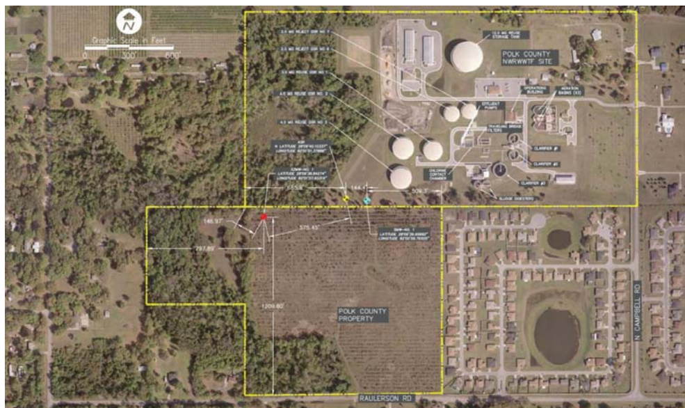
Figure 4. Overall Site Plan

from the chlorine contact effluent chamber wet well to be transferred to the ASR well for recharge via the 23-MG GSRs, and recover water from the ASR well through a vertical turbine well pump to the chlorine contact effluent chamber or the plant's reject tank. The first flush from the recovered water is sent directly to the reject tanks to confirm that it meets DWS; then, it is diverted to the chlorine contact chamber and the water is blended with reclaimed water generated from the treatment plant. The first round of cycle testing was successfully completed by PCU, and it began the second round of cycle testing in August 2015.