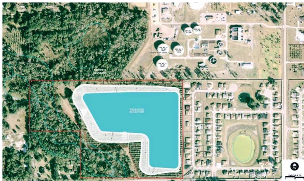
Figure 2. Reclaimed Water System Modification - Site Layout and Proposed Reservoir

In 2012, SWFWMD approved the change to the project plan from the 80-MG groundwater storage and recovery (GSR) to a 1 mgd ASR project. The SWFWMD agreement was fully executed in May 2013. During this time, the scope definition was being shaped, together with SWFWMD. As a result of the inherent risk of drilling a reclaimed water ASR well in an area